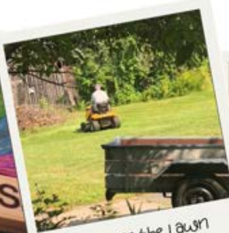
Mowing the Lawn